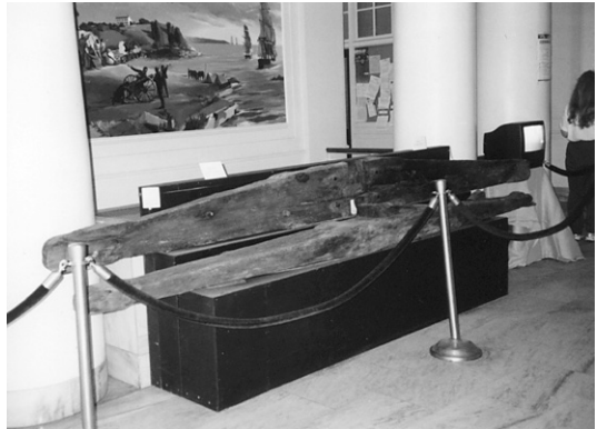
HMS Confiance 's huge anchor has been recovered from Cumberland Bay and is now displayed in Plattsburgh's City Hall. The large, wooden crosspieces have been removed and are shown in the photo to the right.