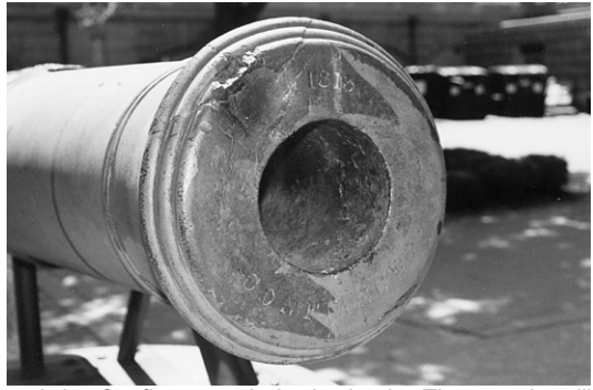
The 32-pound Carronade that killed Captain Downie aboard the Confiance early in the battle. The muzzle still bears the indentation from the ball that struck the gun forcing it off its carriage and back onto Downie.