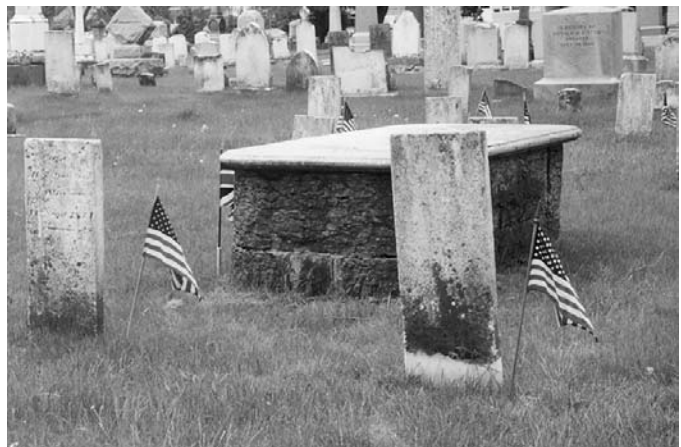
Left and above: The grave of Captain George Downie at Plattsburgh's Riverside Cemetery. The officers killed in the battle were interred here, side by side with their American antagonists. The enlisted men were buried together in a mass grave on Crab Island. The gravesite is unmarked to this day.